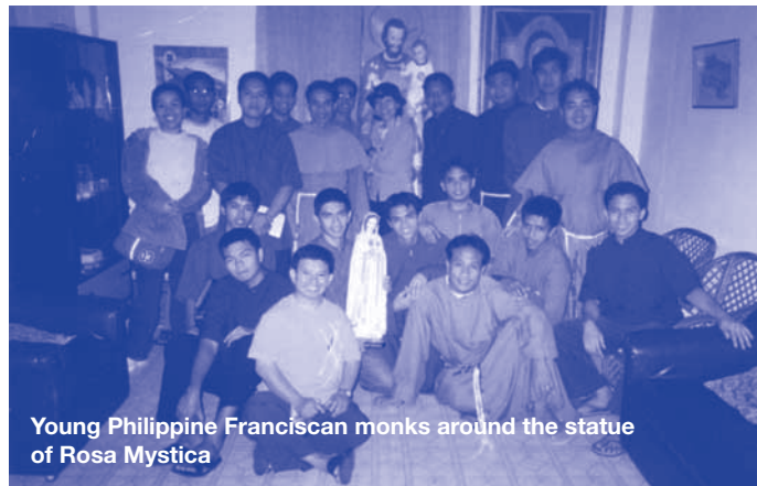
Young Philippine Franciscan monks around the statue of Rosa Mystica